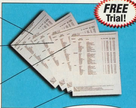
A Scientific method that really works!

Follow this program and you won't be able to keep the smile off your face