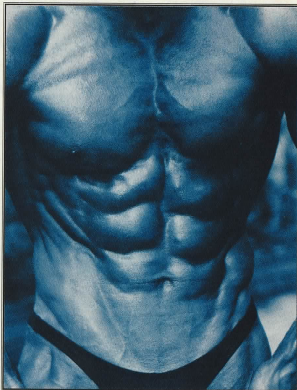
The BodyCraft kit includes “computer generated” plans for you to build your own washboard abs!

must follow. You'll be eating simple meals... basic foods like chicken breast, rice, vegetables. Simple, tasty meals make it easy. All the good stuff. You'll eat fresh, wholesome foods in exactly the correct amounts. You cannot fail... simple foods. Exact amounts. Easy workouts. You can do it. In fact, models and bodybuilders go from “fat” to “washboard abs” in under 6 weeks using this exact method. Success is yours when you follow these simple plans. Here's what will happen to your body: Week One, you won't see much change, but you'll feel energized. Week Two, about 3 pounds of fat are gone! Week Three, a total of 5 pounds of fat are gone and new muscle is appearing in all the right places. Week four, up to 8 pounds of fat melted off your body. Muscle appears where before there was none. Now, look in the mirror to see Washboard Abs. Follow the plans for